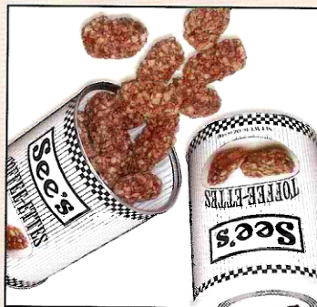
Toffee-ettes® 1 lb. $15.60 (#316) MSRP