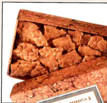
Peanut Brittle 1 lb. 8 oz. $14.70 (#355) MSRP